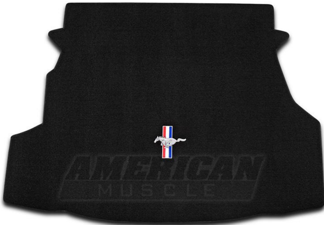
Trunk Mat - Embroidered Pony - Coupe (10-12 All)