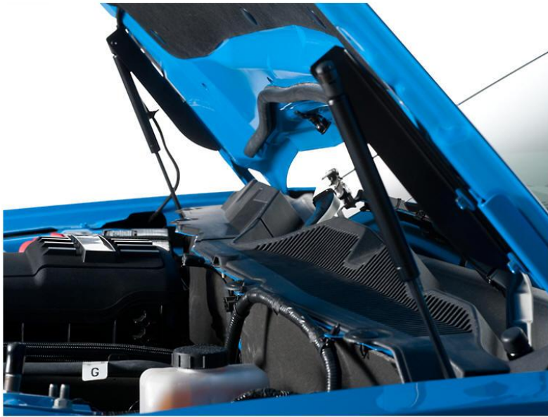
Bolt On Hood Strut Kit - Black (05-12 All)